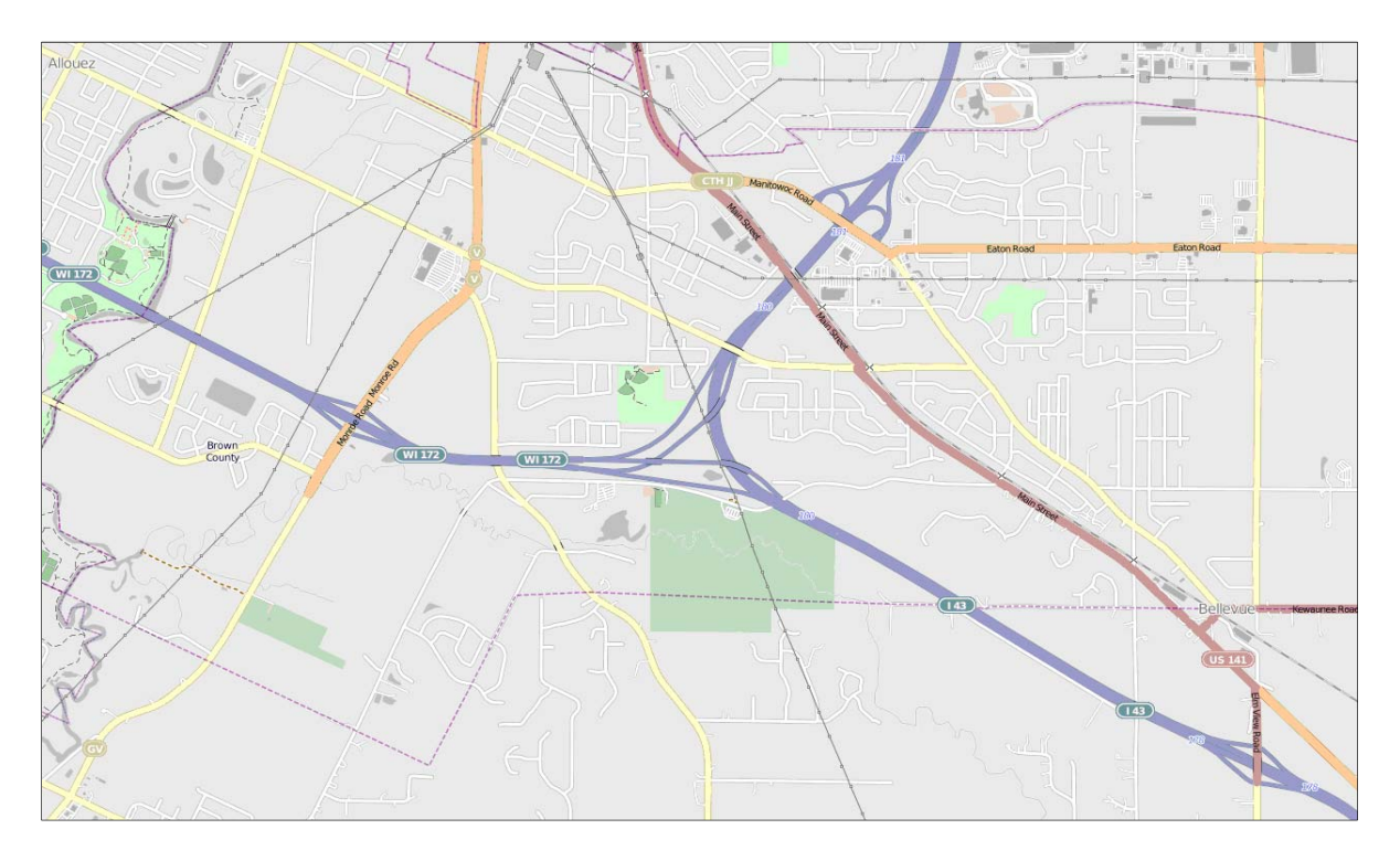
Figure 2. Map of I-43 & WIS 172 Interchange, Bellevue, Wisconsin

The procedure is tolerant of a limited amount of missing or surrogate count data. For example, most Wisconsin freeways have counts on ramps and basic freeway segments, but not on the short segments between ramps at an interchange, and this situation is easily accommodated as in the Table 1 example. The process is also reasonably tolerant of the use of old data as a surrogate when some of the newer data is unavailable (for example, combining current mainline counts with a combination of old and new ramp counts). Nevertheless, there are some instances where balancing is thwarted by incomplete data. For example, if an exit splits into two downstream ramps and only one of them has been counted, the missing ramp's volume must be collected in order to determine the total volume (without this data the balancing process can produce misleading results or fail entirely).